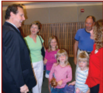
Congressman Diaz-Balart meets with constituents at a Town Hall Meeting he hosted at the Southwest Broward Regional Library

After Hurricanes Katrina and Rita struck, we quickly responded with several pieces of legislation to address the needs of the hurricane-ravaged areas. Some of the bills increased aid through the National Flood Insurance program, the Student Grant Hurricane and Disaster Relief Act, the Temporary Assistance for Needy Families Emergency Response and Recovery Act, and a supplemental emergency appropriations bill to help pay for the recovery effort. (H.R. 426 passed the House on 09/08/2005)